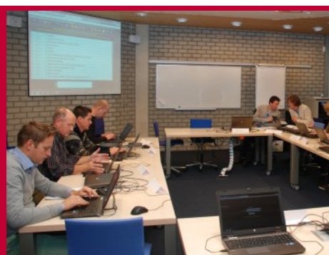
Group decision room

For more information go to http://www.climateplanning.tk/