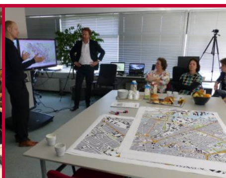
Support planning process