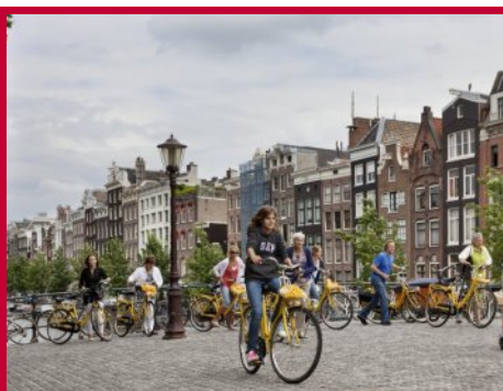
Effects of weather on cycling

For more information go to http://www.climateplanning.tk/