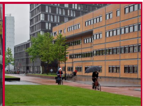
Influence urban design

CESAR is part of the NWO-programme Sustainable Accessibility of the Randstad